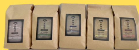
TANTETSU COFFEE BEAN ¥1400 EACH