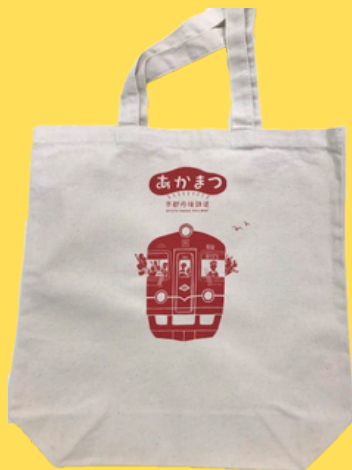
TOTE BAG ¥900